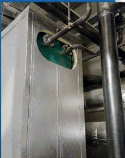
The German heating system regulation stipulates that plate heat exchangers are to be jacketed.

thermowave plate heat exchangers of type EL 250 EBGL-500 each absorb the motor heat of the CHP and transfer it to the heating circuit and drinking water circuit respectively.