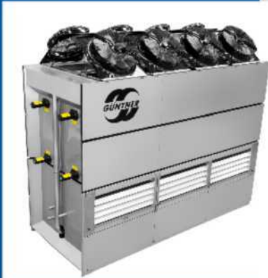
Guntner ECOSS NLA3

This innovative solution ensures that the maximum carcass weight loss does not exceed 1.7 %, which equals savings of approximately US$ 6,450 per day. This is an annual saving of US$ 2,320,000 when compared to weight losses of 2.3 % in the former system.