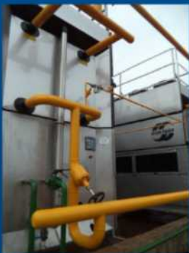
Guntner ECOSS NLA3 on the roof top

With a multitude of benefits related to low operating and maintenance costs coupled with low water consumption, high energy efficiency and high thermal performance, Guntner's ECOSS series of units greatly surpass the concept of "Eco-friendly", especially being built for a long service life using a manufacturing process which is notably less aggressive to the environment.