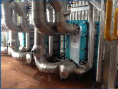
Thermowave plate heat exchangers